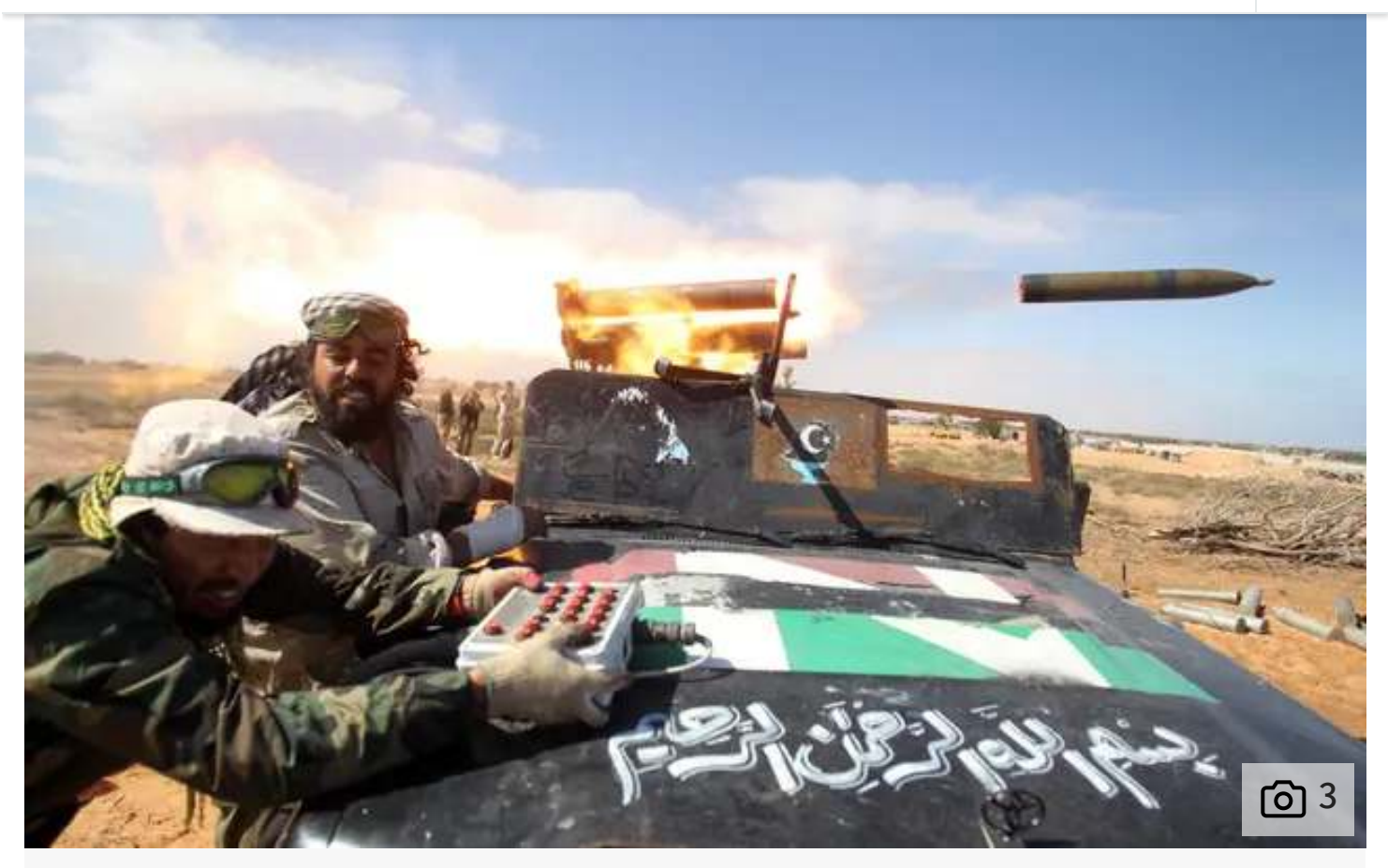
Libyan rebels fire a rocket as they enter the northern city of Sirte, 10 October 2011

Norway became an active member of the Nato bombing campaign, eventually dropping nearly 600 bombs. But at the same time the country's prime minister Jens Stoltenberg, who is now Nato's secretary-general, asked foreign minister Store to continue the top secret talks, hosting them in Norway.